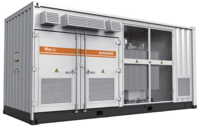
SUNGROW Inverter, Designed For TrinaPro

Turnkey Station for North America 1500 Vdc System - MV Transformer Integrated